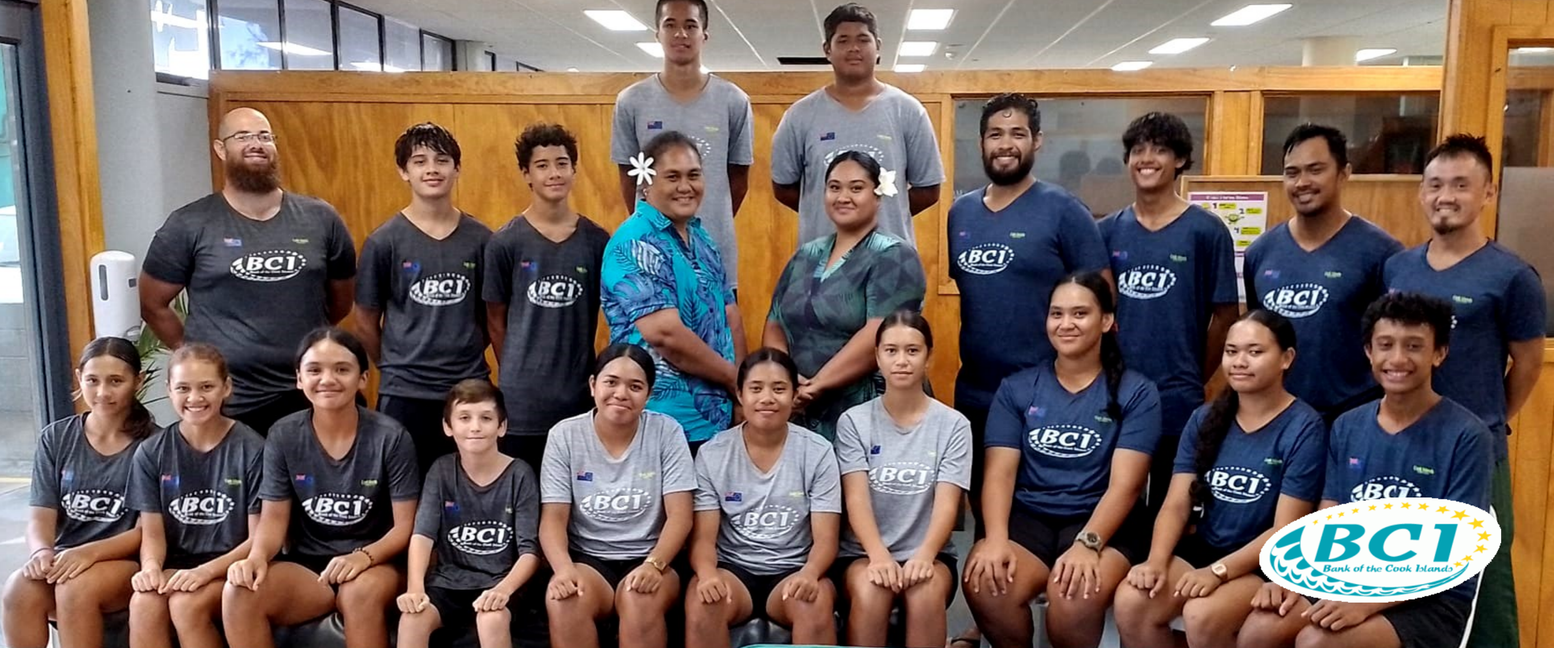
Proud Sponsors of the Cook Islands Team to the Victor Oceania Championships 2023