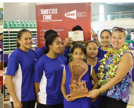
Senior Overall Champions TITIKAVEKA COLLEGE