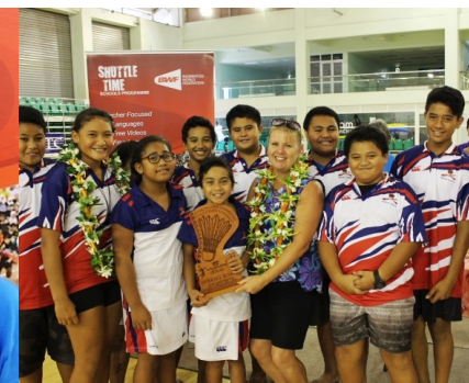
Junior Overall Champions AVARUA SCHOOL