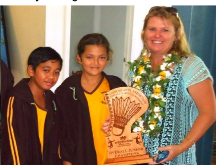
Overall Junior Champions NUKUTERE COLLEGE