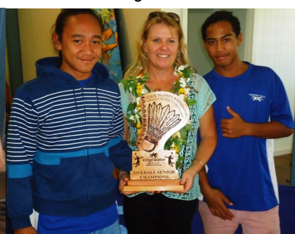
Overall Senior Champions TITIKAVEKA COLLEGE